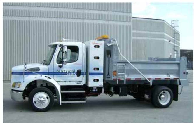
CNG-powered Freightliner M2 112 medium-duty dump truck is one of five natural gas trucks purchased by Enbridge Gas Distribution in Ontario for its fleet.

Growing Fleet Interest - The first deliveries of medium- and heavy-duty natural gas trucks from original equipment manufacturers have also taken place over the past year in Canada. Enbridge Gas Distribution took delivery of two Freightliner M2 112s with factory-equipped compressed natural gas (CNG) fuel systems, and Cummins Westport ISL G engines. Enbridge also had three International Model 4400s converted at a local International truck dealer, using Emission Solutions engines, and dedicated CNG fuel systems.